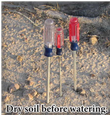
Dry soil before watering.