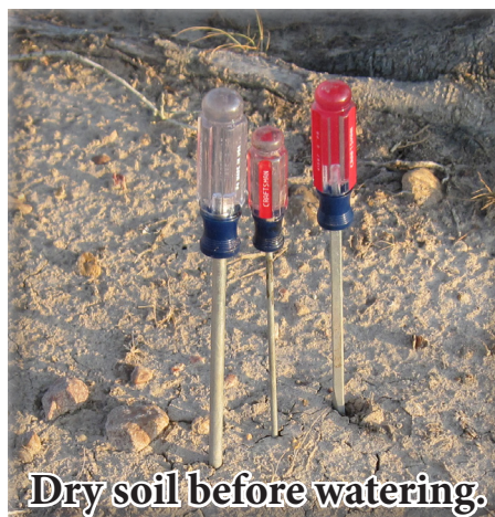
Dry soil before watering.