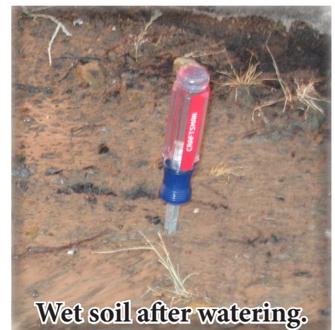
Wet soil after watering.