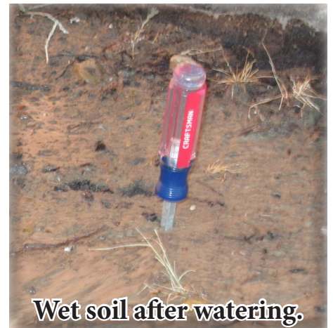
Wet soil after watering.